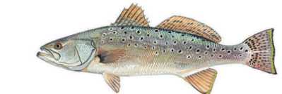
SPOTTED SEA TROUT

Many freshwater fish CAN LIVE in brackish environments. Most saltwater fish ONLY TOLERATE brackish environments.